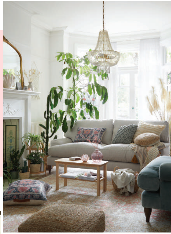
Items priced from £6, all available from dunelm.com

Biophilic design (where plants and nature form a key part of your interiors scheme) is a huge trend for 2022, and what better time to breathe new life into your home? Adding a range of houseplants and succulents to your interiors can help revitalise the space and add interest without feeling cluttered. Check page 39 for Dobbies' advice on houseplant trends.