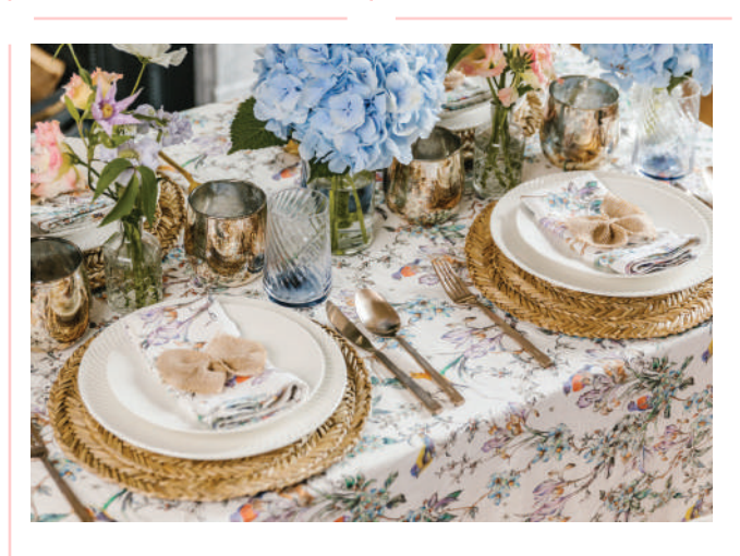
Wildflower Garden collection, prices from £8, truffletablescapes.co.uk