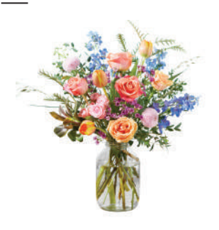
The Lupita bouquet, £50, bloomandwild.com