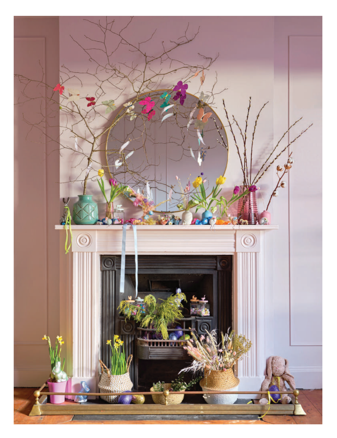
Hubba Accent Mirror, £121.99, Sanatoga Poppy Hare Sculpture, £25.99, Merrick pink glass vases, from £21.99, Selection of baskets, various sizes and price options. All wayfair.co.uk.