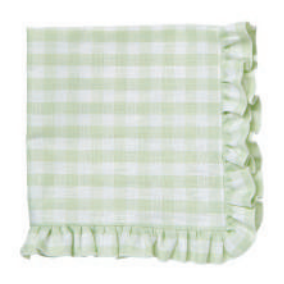
Ruffle gingham napkin in pastel green, £24, rebeccaudall.com