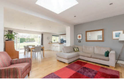
Bright & generously proportioned family accommodation | Vestibule | Hall | Sitting room | Spacious open plan kitchen/dining room/family room | Principal bedroom with en-suite | 4 further double bedrooms | Bathroom | Shower room | Utility | Delightful garden| Driveway IGCH I