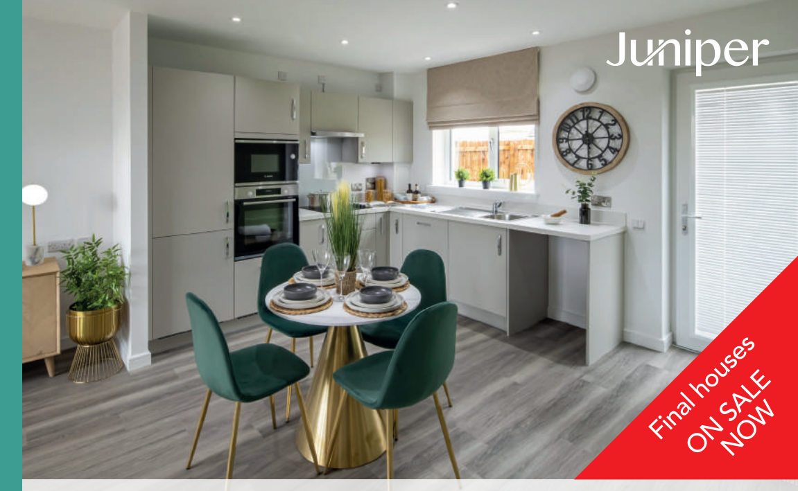
Muirwood Gardens, Kinross - Age exclusive 2 & 3 bedroom homes for over 55s