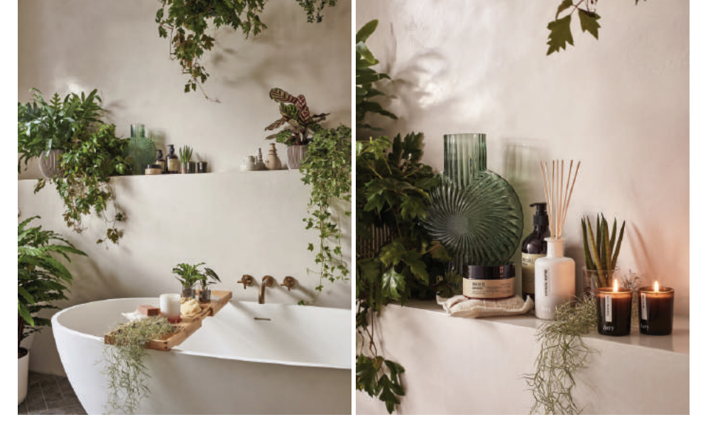
Image above left: Calathea wavestar £29.99; Phlebodium aureum blue star £14.99; Cissus rhombifolia £26.99; Tillandsia usneoides £14.99; Calathea makoyana £16.99; Hedera white variegated £4.99; glass vase, £29.99; stoneware vase, £9.99 Image above right: Spa products from Dobbies; Cissus rhombifolia £26.99; Tillandsia usneoides £14.99; glass vase, £29.99

Image to left: Rare plant apothecary from Dobbies Garden Centres featuring Philodendron painted lady (limited edition), £49,99; Monstera variegata (limited edition), £299,99; Calathea fusion (limited edition), £59,99; Syngonium podophyllum albo variegata, £44.99; Calathea ornata, £29,99; Lisbon pots, from £5.99 to 12.99; Leon white pot, £8.99; Retro gold pot, £4.99; Cylinder groove green vase, £21.99; Angelina wall decoration £19,99; Fiesta velvet cushion £14.99; Pink velvet cushion.