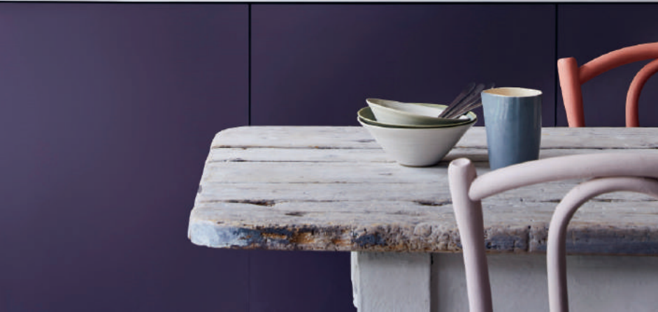
Kitchen cupboards in premixed Aubusson Blue and Emperor's Silk, POA, anniesloan.com