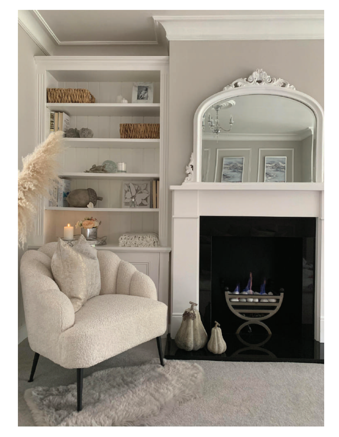
Evelyn armchair in ivory boucle, £349, cultfurniture.com