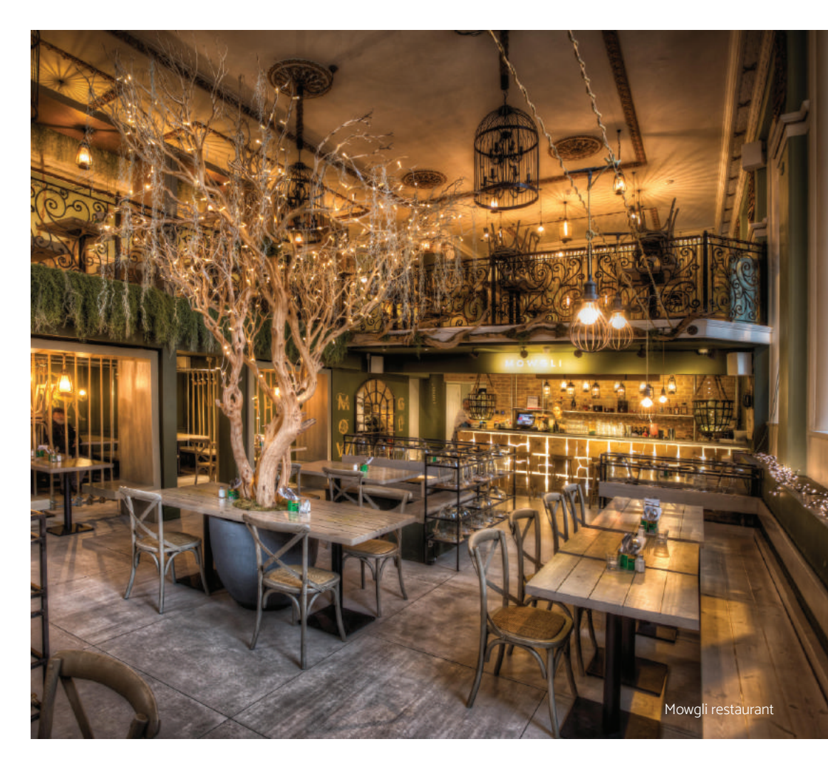
We share the upcoming events, new openings and exciting launches coming to Edinburgh, the Lothians, Fife and the Borders in 2022...