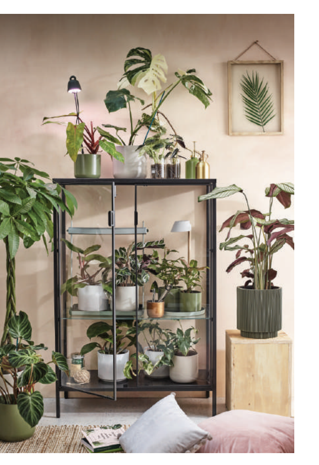
Dobbies' houseplant expert talks us through the greenery we should be adding to our homes this January

Once the festivities are over and the decorations have been taken down, our homes can suddenly feel quite empty, making us look for ways to fill the space.