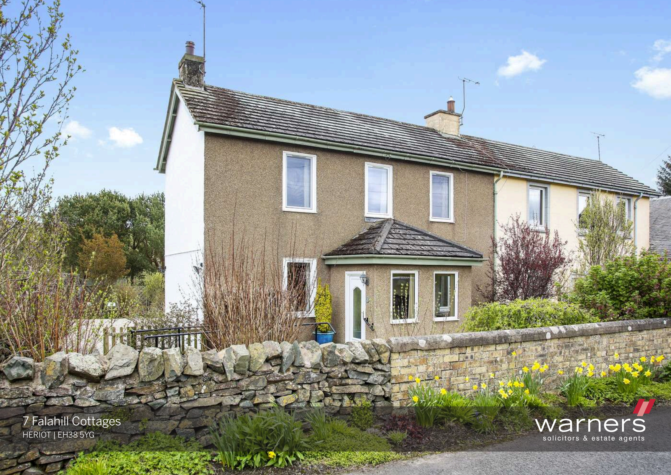
7 Falahill Cottages HERIOT | EH38 5YG