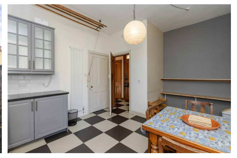
Note: No warranties will be granted in respect of any appliances or systems included in the sale.

Resident permit parking is available on application to the City of Edinburgh Council.