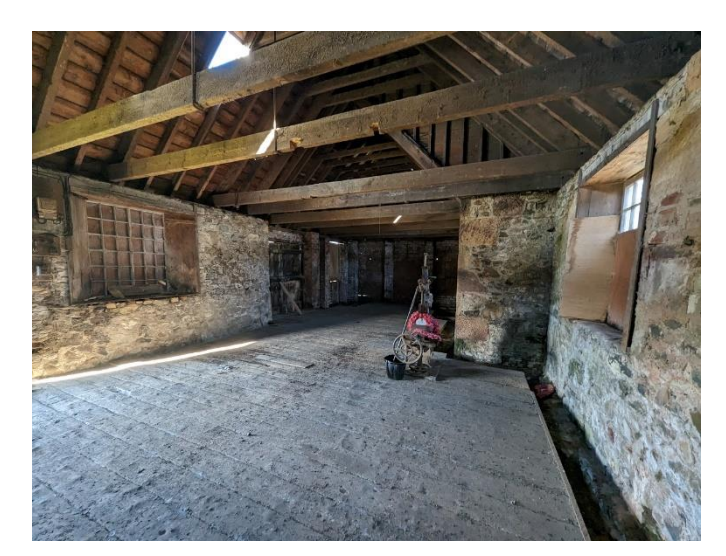
N. B. No services currently connected

These particulars have been carefully prepared by Messrs Pollock & McLean, Solicitors and Estate Agents. Although believed to be correct they are not guaranteed and therefore prospective purchasers should satisfy themselves as to the basic facts before submitting an offer. All photographs have been taken using a wide angled lens.