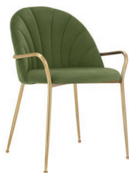
Sylvia Dining Chair With Armrest, Velvet Upholstered, Moss Green With Brass Frame, Cult Furniture, £119, cultfurniture.com