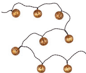
Solar Bronze Moroccan Ball Lights, Lights4fun, £19.99, lights4fun.co.uk