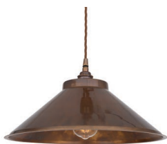
Rio Pendant Lamp - Antique Brass, Nicholas Engert Interiors, £203, nicholasengert.co.uk