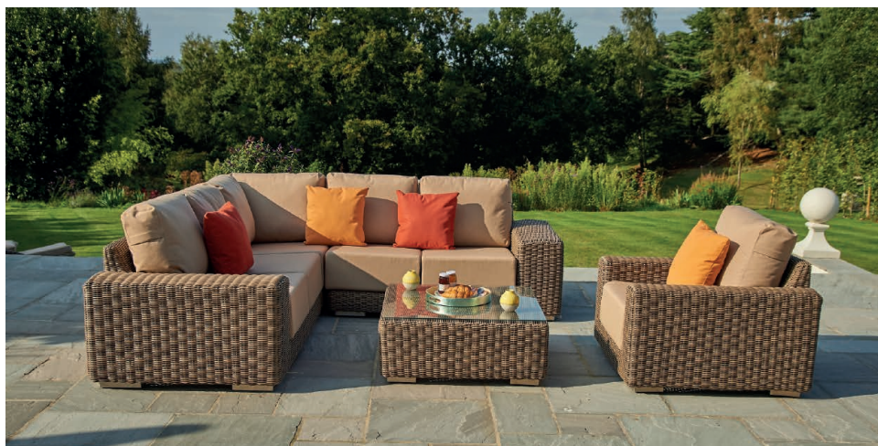
Bridgman Garden 6 Piece Kensington Modular Sofa Set H, BRIDGMAN, £6699, bridgman.co.uk