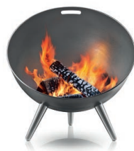
Eva Solo FireGlobe Outdoor Fireplace, Beaumonde, £299, beaumonde.co.uk

Now's the perfect time to update your garden patio with some stylish new accessories. Create a welcoming and inviting space with stunning furnishings, lights and decorations.