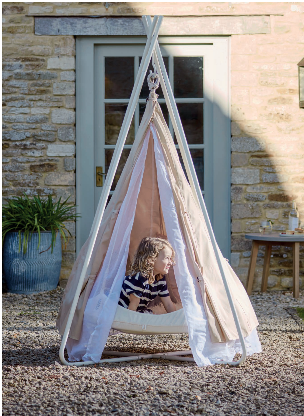
Indoor Outdoor Hanging Bell Tent – Kids, Cox & Cox, £595, coxandcox.co.uk