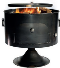
Pete's Oven - Fire Pit and Pizza Oven, FirepitsUK, £545, firepitsuk.co.uk