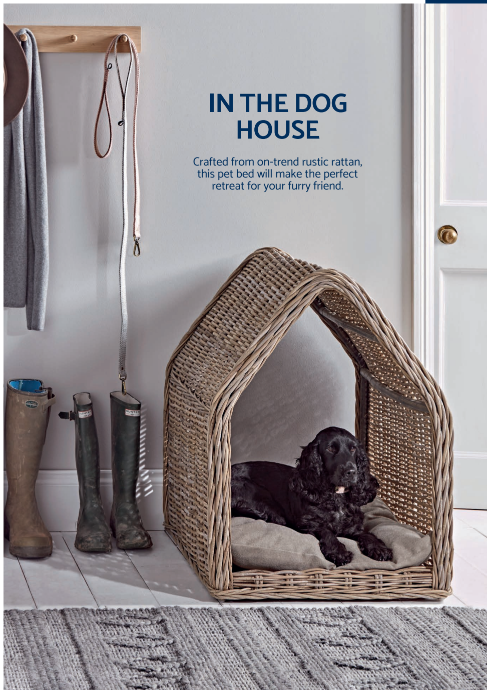
Rattan Pet House – Large, Cox & Cox, £225, coxandcox.co.uk

Crafted from on-trend rustic rattan, this pet bed will make the perfect retreat for your furry friend.