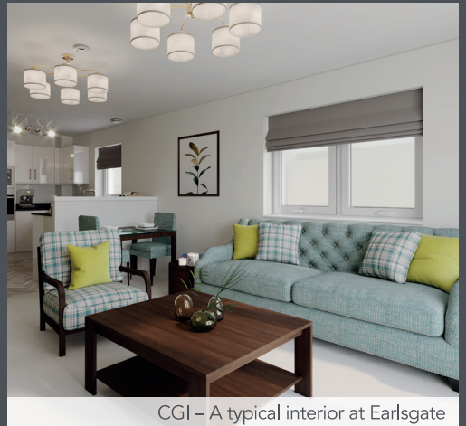
CGI – A typical interior at Earlsgate