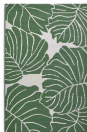
Ada Botanical White & Green Outdoor Rug 120 x 180cm, Homescapes Online, £17.99, homescapesonline.com