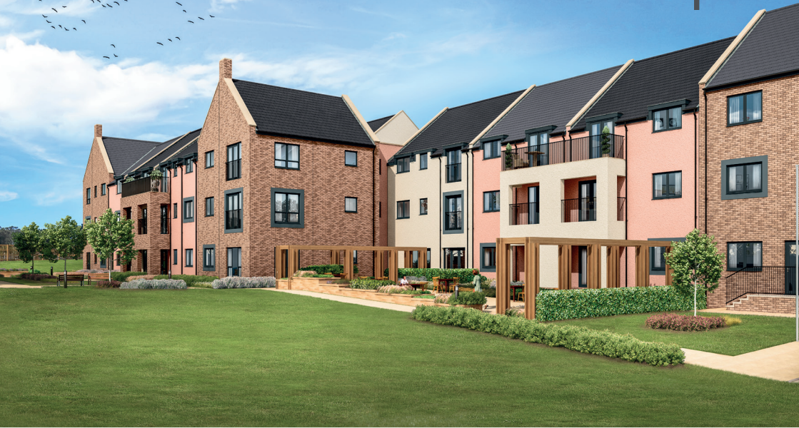
CGI – Exterior at Earlsgate