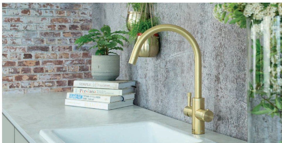
QETTLE Signature Modern Boiling & Filtered Water Tap, QETTLE, £985, qettle.com