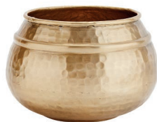
Hammered Brass Flower Pot, Heavenly Homes and Gardens, £39, heavenlyhomesandgardens.co.uk