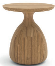
Manutti Tsuki Outdoor Side Table in teak, Go Modern Furniture, £860, gomodern.co.uk