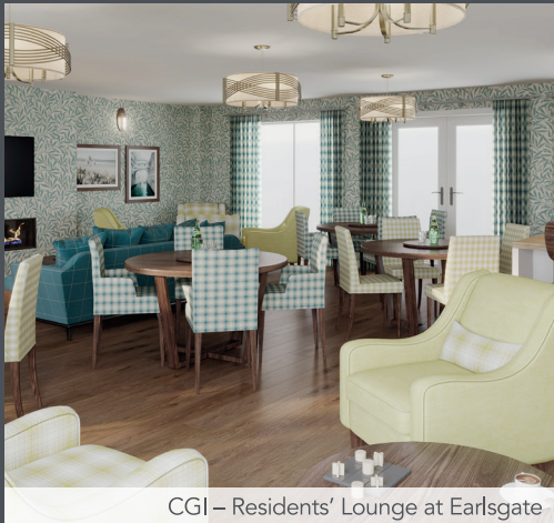
CGI – Residents' Lounge at Earlsgate