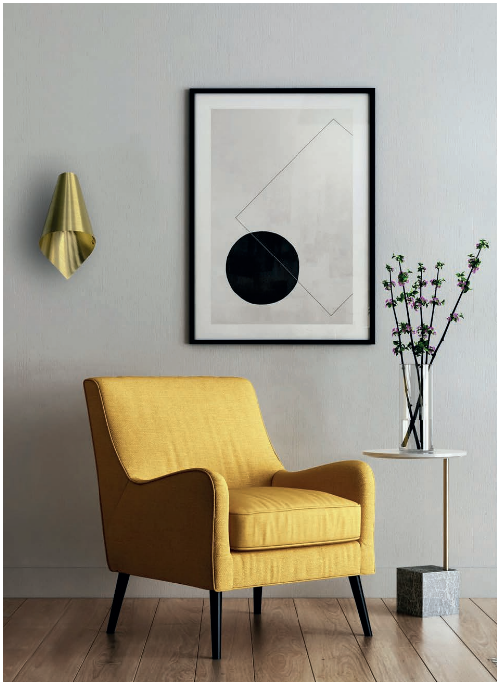
Brushed Brass Wall Light, arcform, £165, studioarcform.com