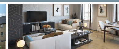
Prices from £195,200

See the Difference at dwh.co.uk or call 0333 355 8461