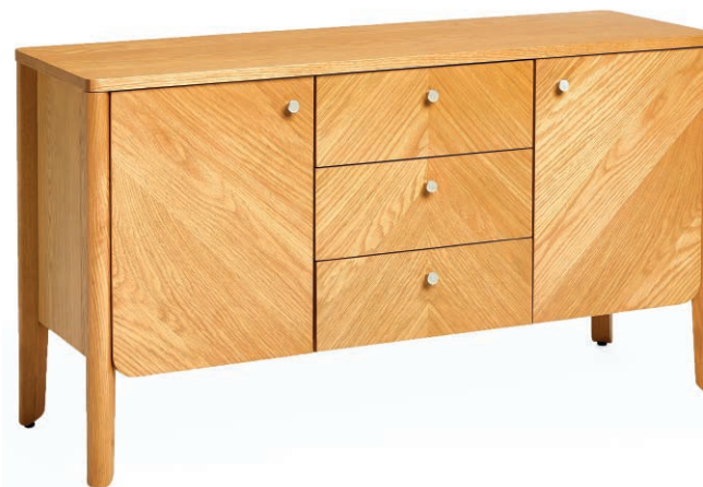
Fern sideboard in oak, £399

“ ESPC LOVES... this retro-inspired sideboard. It's the perfect place to stash away clutter, and the timeless design will always look chic. ”