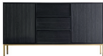
Osaka Black & Brass Sideboard, Rose & Grey, £875, roseandgrey.co.uk

This sleek trend combines classic Japanese minimalism with rustic Scandi style – simplicity and sophistication at its finest.