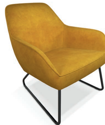
Form accent chair, black metal leg, in mustard velvet £149

“ ESPC LOVES... this retro-inspired sideboard. It's the perfect place to stash away clutter, and the timeless design will always look chic. ”