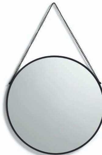
Thin aluminium frame round hanging mirror in black, £20