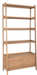
Marston Oak Bookcase, Habitat, £295, habitat.co.uk