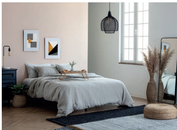
Sigmund tiered mesh pendant shade, Iconic Lights, £36, iconiclights.co.uk