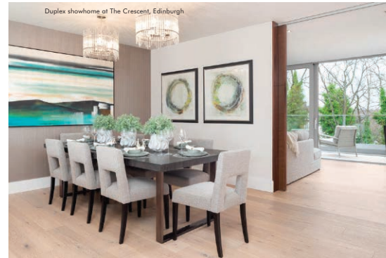
Duplex showhome at The Crescent, Edinburgh