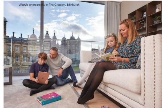
Lifestyle photography at The Crescent, Edinburgh

For more information or to arrange an appointment, please visit: cala.co.uk/thecrescent or call 0131 341 2667.