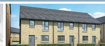
A range of apartments and houses