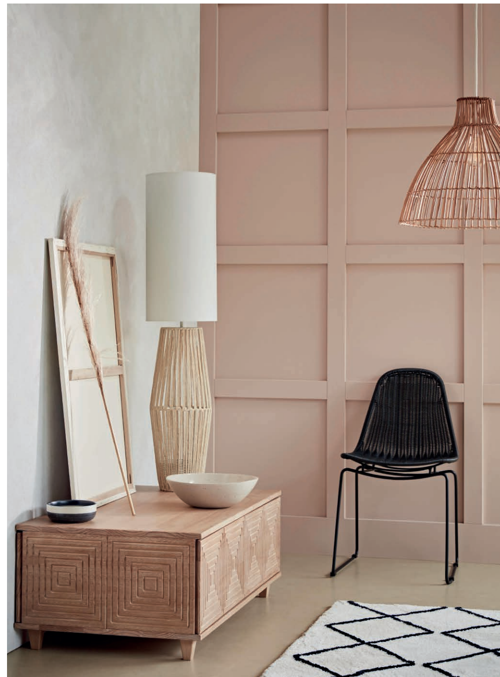
Rattan ceiling shade, £60, Floor lamp, £50, Coffee table, £195, Rattan effect dining chairs, £140 for two, Stripe pasta bowl, £3.75, berber rug, £60, all Habitat, habitat.co.uk