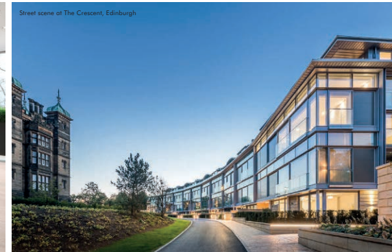
Street scene at The Crescent, Edinburgh

A CONTEMPORARY SPACE THAT FEELS LIKE HOME 3 BEDROOM HOMES SET OVER TWO LEVELS PRICES FROM £1,475,000