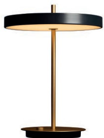
Anthracite Asteria Table Lamp, Dowsing & Reynolds, £279, dowsingandreynolds.com