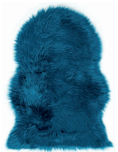
Faux fur sheepskin rug in fjord, £25