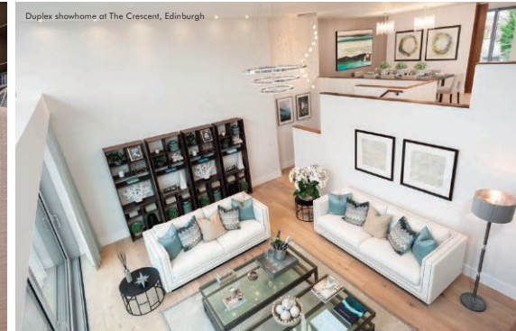
Duplex showhome at The Crescent, Edinburgh