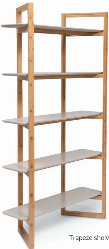
Trapeze shelving unit in bamboo/grey, £199

“ ESPC LOVES... this cosy faux sheepskin rug. Mix up your styling by throwing this over an armchair to create a comfy reading nook, or scatter a few over your dining chairs, for a sumptuous Scandi vibe. ”